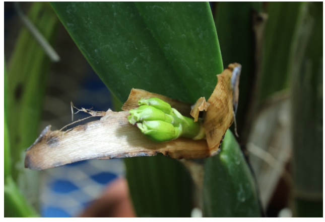
Dried sheaths usually do not present a problem, in fact they protect the emerging buds from mechanical damage and chewing pests.

Cattleyas. The winter blooming season is upon us. If the flower sheath is a yellow sickish color or looks wet, consider gently peeling it apart or splitting it open with a sterile blade to allow condensation from fluctuating day night temperatures to dissipate, so that the emerging buds do not rot inside the sheath. Dried sheaths are not a problem, except that you are anxiously awaiting the flowers to enlarge and break free.