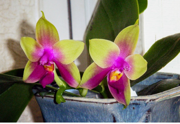
The spring blooming phalaenopsis are getting ready to put on their show, blooming for 3 months or longer, before you cut the stems and repot in June.