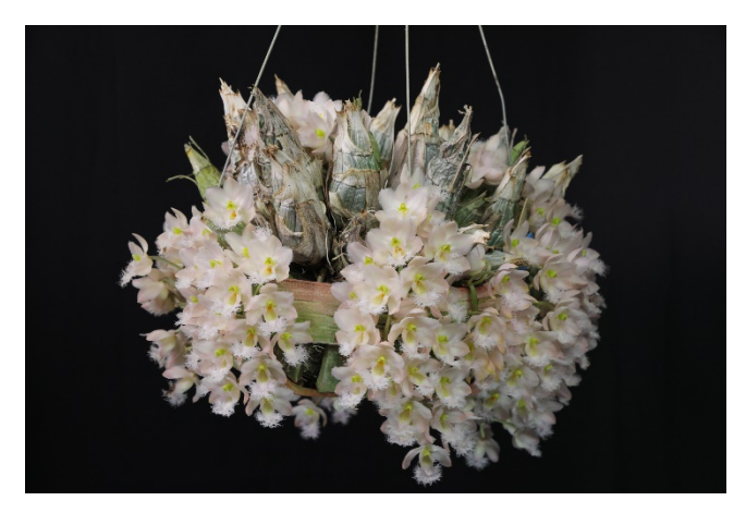
Clowesia Grace Dunn 'Chadds Ford' AM/AOS is one of the late winter blooming varieties that flowers profusely from leafless pseudobulbs.

cool weather and start dropping leaves below 60F. Keep them cozy in their winter homes for another few months.