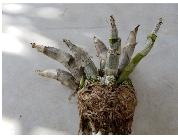
The best time to repot catasetums is when you first see the new green growths emerging at the base of the pseudobulbs.

Catasetinae. This is the flowering season for the winter blooming genera like the small flowered Clowesias and Mormodes, and their intergeneric hybrids including Fredclarkearas and Mormodias. The energy they have stored up in the fat pseudobulbs allows them to flower beautifully, even from leafless bulbs. These are the last Catasetinae to go dormant, so they will be the last to break dormancy in the spring. The summer blooming Clowesias and Catasetums may have gone dormant months ago and are now slowly waking up. Check them weekly for signs of new green growths. This is the best time to repot them, when the growths are just beginning and they have not yet starting growing new roots. You can cut away old and tired growths and roots and orient the new growth toward the center of the pot. The new growths will start rooting in a matter of days and will quickly fill the pot. Avoid the urge to water until the roots and new growths are about 5 inches long and the new leaves have unfurled.