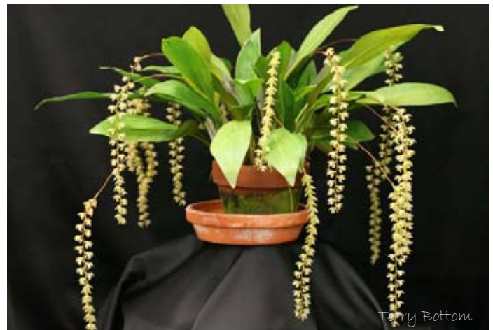
Grower Sue Bottom Dendrochilum glumaceum