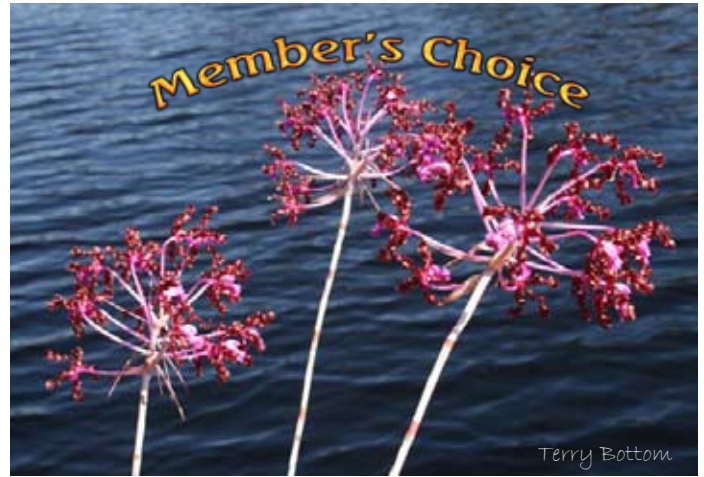
Grower Sue Bottom Schom. undulata