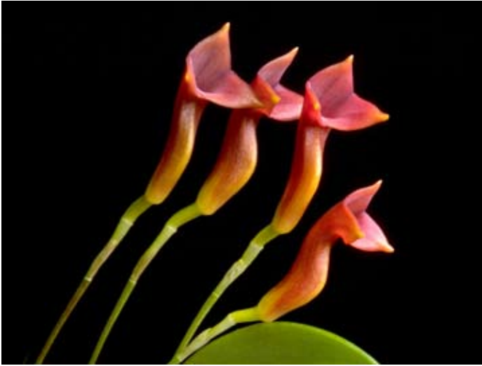
Masdevillia angulifera