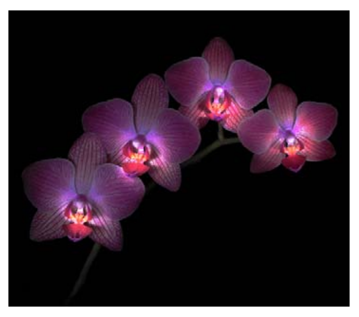
Painted Orchids By Robert Sullivan

One of the most significant changes in fertilizer for orchids is the availability of a slow release fertilizer named Nutricote. This product is being used by many commercial orchid nurseries, but is even more important to the hobbyist who has just a small number of orchids. Available as Dynamite in small quantities from Home Depot stores, this is an easy to use fertilizer that delivers a constant supply of nutrients for a set amount of time. Most last for six months and provide micronutrients as well.