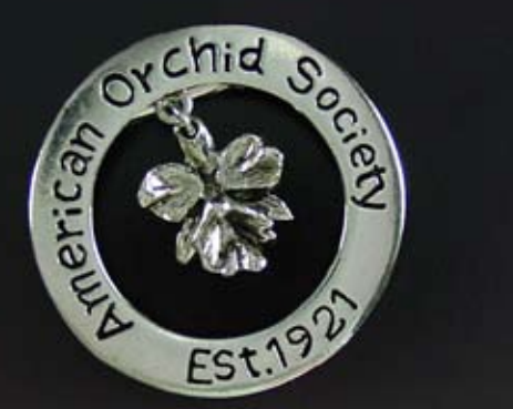
... and Thank You for Supporting the American Orchid Society With Your Purchase