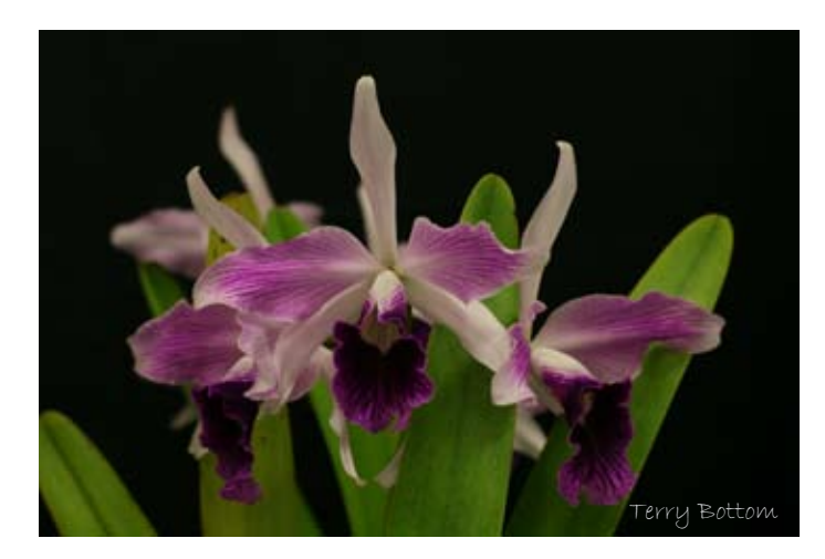
Grower Sue Bottom L. purpurata var. striata