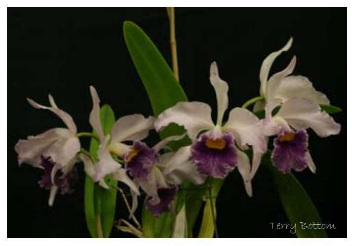
Grower Sue Bottom C. Dupreana coerulea