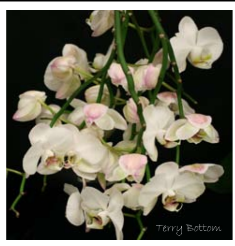
Grower Stacy Manges Phalaenopsis NOID