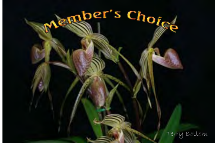
Grower Courtney Hackney Paph. Lady Isabel