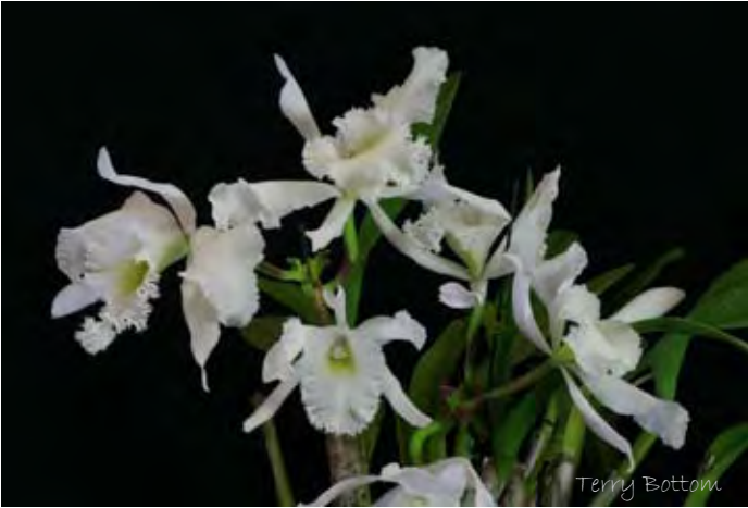
Grower Sue Bottom Bc. Diadem