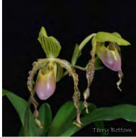
Grower Courtney Hackney Paph. sanderianum x primulinum