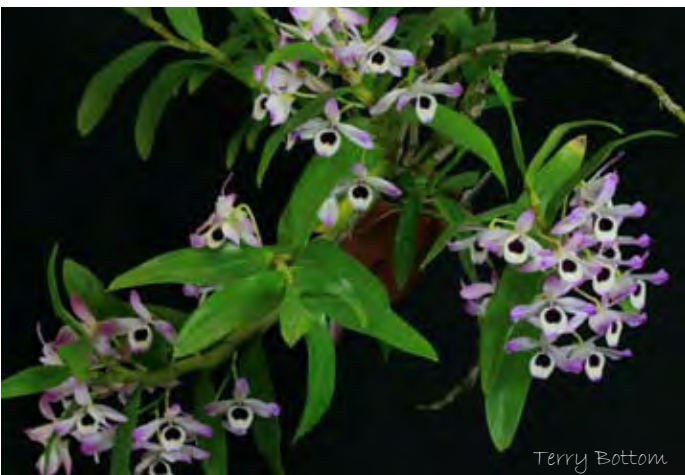
Grower Sue Bottom Den. nobile