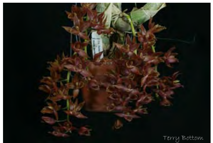
Grower Sue Bottom Mo. Leopard Drops