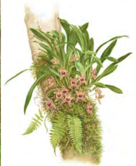
Kefersteinia koechlinorum 'Denise'