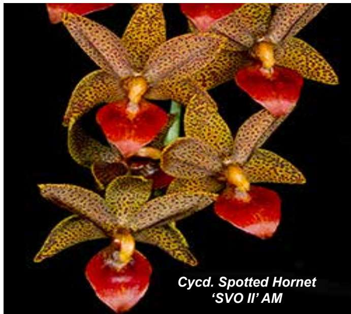
Cycd. Spotted Hornet 'SVO II' AM