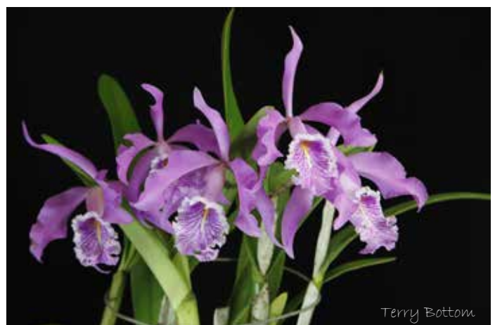
Grower Sue Bottom C. maxima