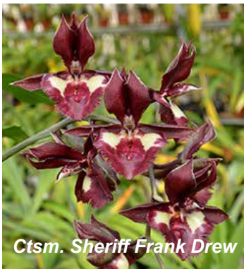
Ctsm. Sheriff Frank Drew

Catasetinae begin their new growth in early spring. However, watering should wait until the new growth has well developed new roots. This means you should let the new roots grow to an approximate length of 3" to 6" before you begin watering. Let me emphasize this point, wait to water until the new roots are 3" to 6" long. Generally the new growth will be 5" to 8" tall before the roots are equally long.