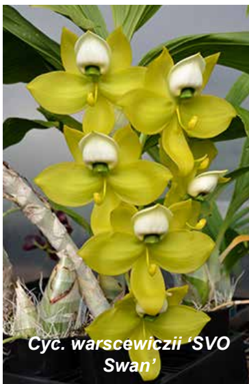
Cyc. warszewiczii 'SVO Swan'

Catasetinae roots deteriorate during dormancy, the new roots will be taking over the job of growing the new pseudobulb so this makes the new roots vital in the plants health. Again reinforcing the message