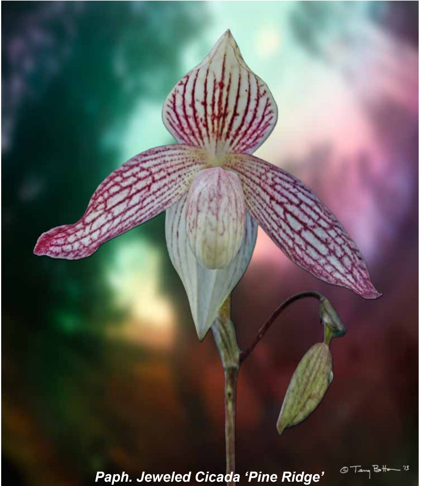
Paph. Jeweled Cicada 'Pine Ridge'