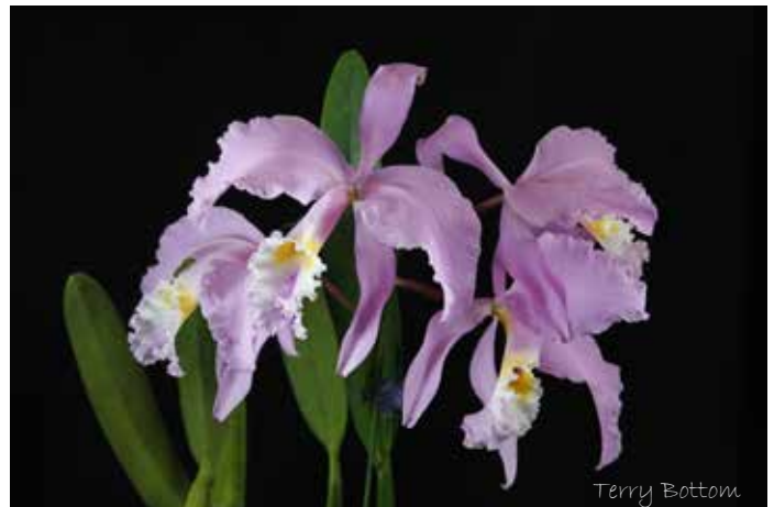
Grower Sue Bottom C. mossiae 'Alayon'