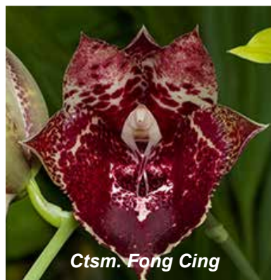
Ctsm. Fong Cing

Light levels at or above those suggested for Cattleya will help insure strong good growth and flowering.