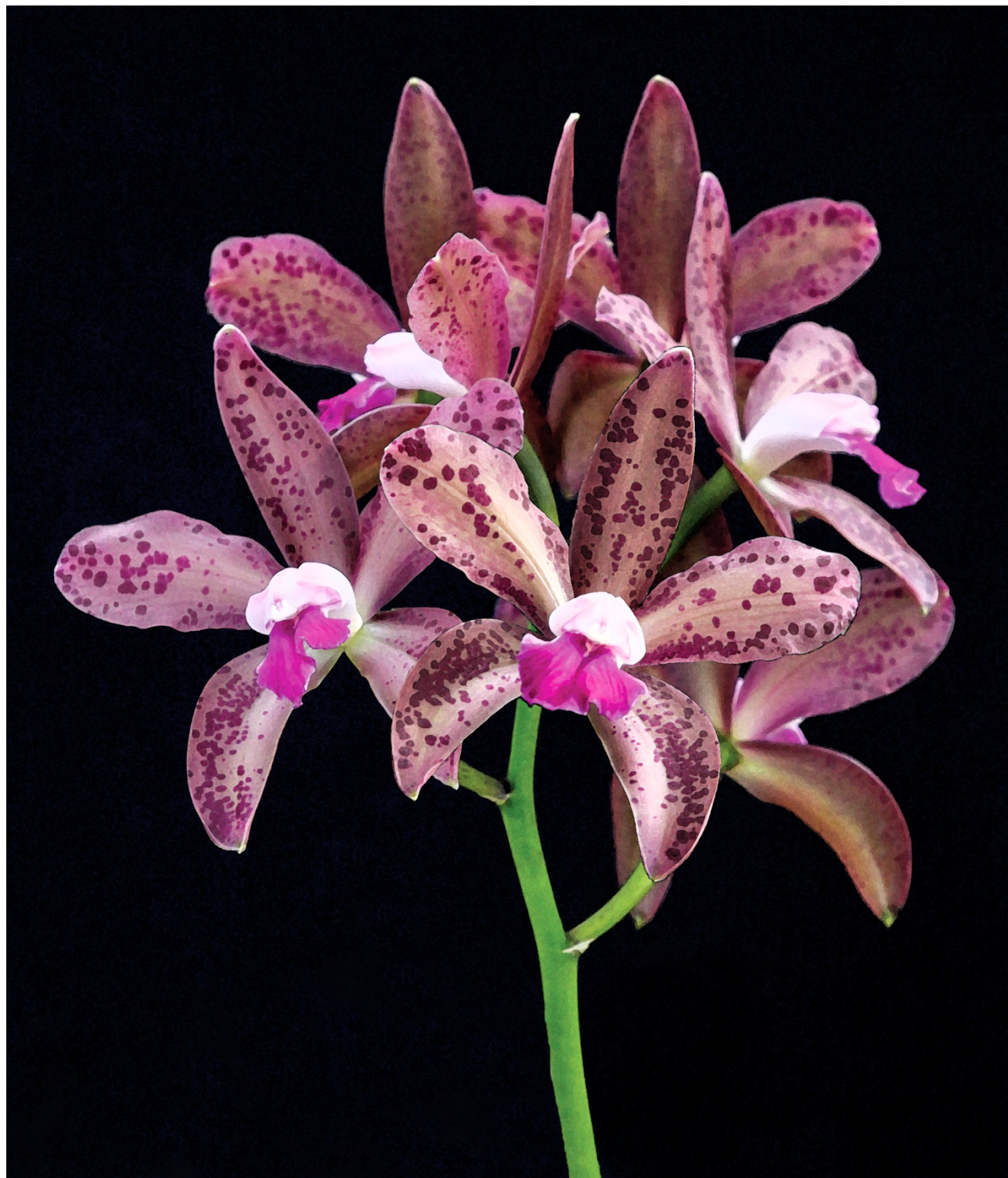
Cattleya Sue Bottom 'St. Augustine' AM/AOS