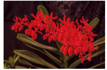
Renanstylis Bangkok Beauty