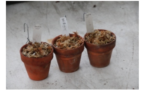
size pot and a dry ProMix blend, tubers want to form at the bottom of coco fiber or something similar to Orient the tuber and keep the ProMix from washing out of the pot and then you wait.

Tuber Orientation. If you just knock the plant out of the pot and clean away the old potting mix like you would with other orchids, you'll find yourself saying oops, which end is up? The first time repotting. I held the tubers in my hand oriented top to bottom from depotting through repotting, to make sure they didn't get turned around. Often you can tell there is a pointy end from which the shoot grows that should be oriented up when you repot. But if you can't tell which end should be up, hedge your bets and lay the tuber sideways.