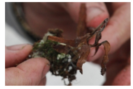
winter, it's time to repot into your tubers found in the bottom of the remember which end is up so you mix of choice.