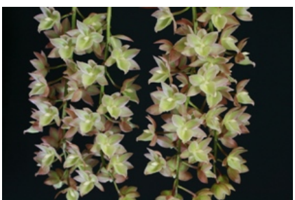
Mormodia. Lime Tiger 'St. Augustine' HCC/AOS