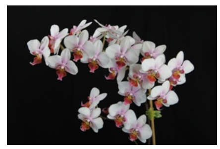
Phalaenopsis Olympia's Cameo x Phal. Little Netsuke