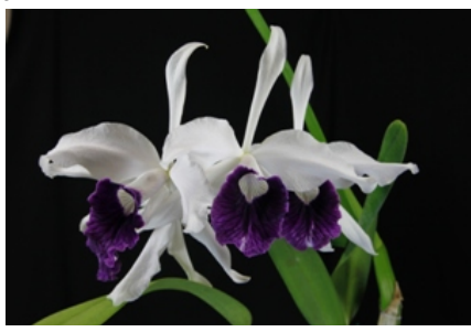
Laelia purpurata var. schusteriana