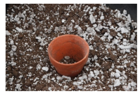
Its new home is a small standard Don't use peanuts because the Top dress with a little sphagnum, though AAA grade sphagnum moss the pot. is another alternative.