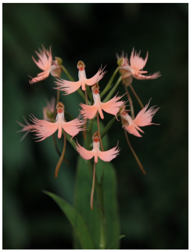
Habenaria Jiaho Yellow Bird (Hab. rhodocheila x Hab. medusa)

Orchid growers go through all sorts of trials and tribulations learning how to grow one type of orchid and then when they finally figure it out, they decide to start growing a different type of orchid. It is probably natural that our taste in orchids evolves over time. After all, if you look back at your recipes from several years ago you realize your ingredients and techniques have morphed over time... though you must be careful not to admit to a Louisiana native that you are now adding beans to the gumbo!