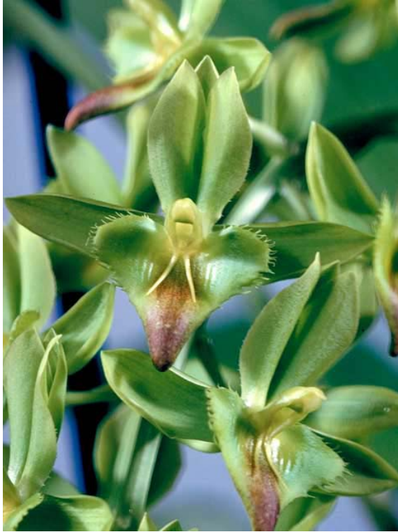
FIGURE 2 – Catasetum trulla 'Adagent', AM/AOS, CHM/AOS

than those producing female flowers. The upright stance of the inflorescence pictured in FIGURE 1, along with the fact that the flowers are clustered at the end rather than spaced out on a longer inflorescence, suggest that it bears female flowers of Calasetum integerrimum .