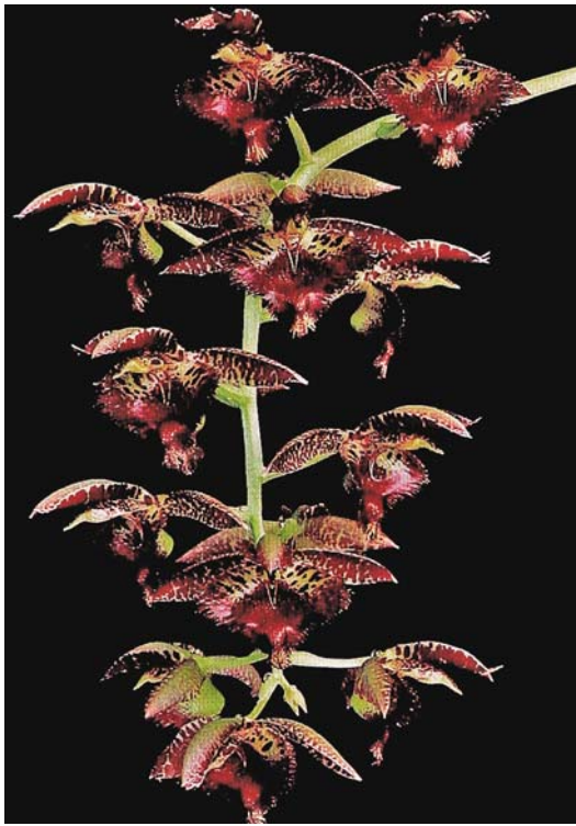
FIGURE 4 -- Catasetum Francis Nelson, ( trulla x fimbriatum ) (male flowers)

FIGURE 5, picturing one male flower and one female flower of this awarded clone side by side, provides us with a wonderful opportunity to compare. The resupinate male flower, on the left, with a natural spread of 2 inches (5 cm), has the open form uppermost position. The sepals and petals of this flower arc strongly reflexed away from the lip, creating a narrow flower 1 inch (2.5 cm) across which appears to be all and large, cupped lip found in so many male Catasetum flowers. The female flower on the right, in contrast, is non-resupinate, its large, hooded lip taking the lip. The column of the female flower, too, is quite distinct, being short and wide rather than long and narrow, and lacking the antennae-like projections found on the columns of male flowers of Catasetum . Lastly, these flowers are very different in color and patterning. Strangely enough, the female flowers of Catasetum Francis Nelson have more in common with the flowers of Catasetum integerrimum (FIGURE 1) than with their male counterparts!