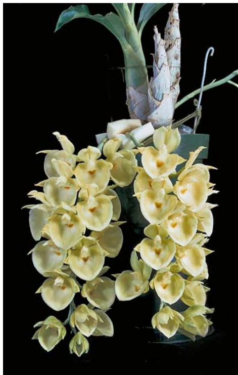
FIGURE 7 – Catasetum pileatum 'Riopelle', CCM/AOS (85pts)