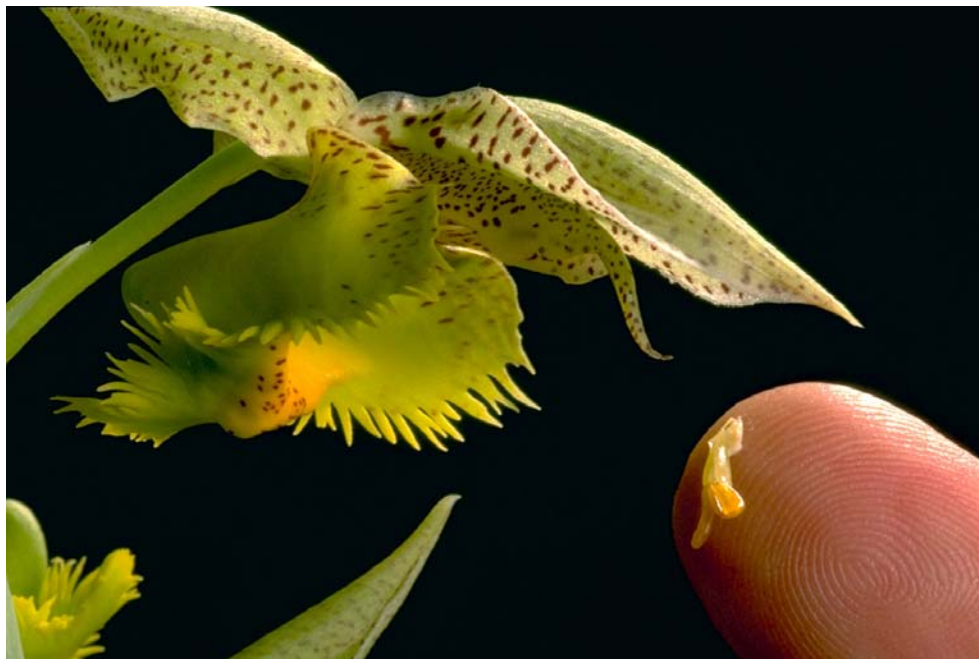
FIGURE 11 – Catasetum fimbriatum showing ejected pollinarium, stipe and viscidium

Whether or not the pollinarium is ejected, the flowers of Catasetum species are notoriously short-lived. Flowers of some species may be open only a matter of a few days before the sepal and petal tips begin to lose their substance and curl. The heavier, almost plastic substance typical of the lip of many Catasetum flowers may be the reason it is the last part of the flower to fade. Apart from any inherent tendencies, flower longevity in Catasetum is very dependent on temperature and humidity conditions. Flowers opening in the heat of mid-summer may last less than a week, while flowers produced by the same plants, opening in the cooler weather of late fall or early winter may last nearly two weeks. The combination of high temperature and low humidity is especially damaging, though low humidity alone can greatly reduce the life of a Catasetum flower.