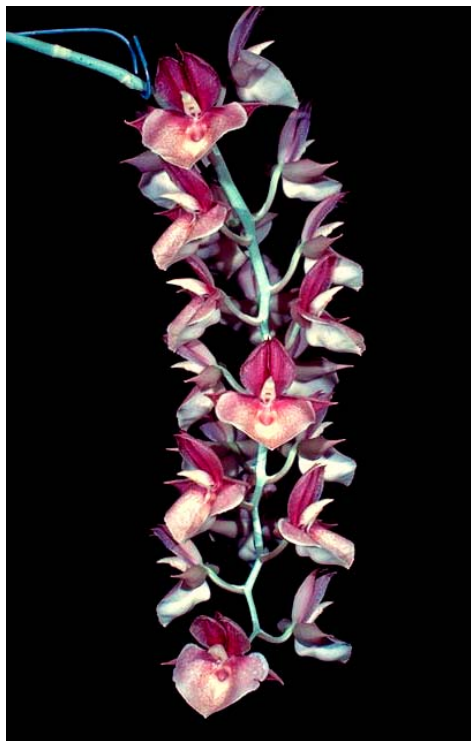
FIGURE 8 – Catsetum expansum 'Robert', AM/AOS (86pts)

central, sac-like depression (FIGURE 6).