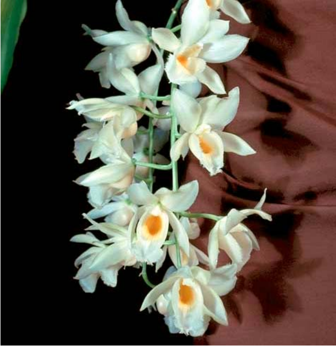
FIGURE 6 – Catasetum Delightful 'Anastasia', HCC/AOS (76pts)