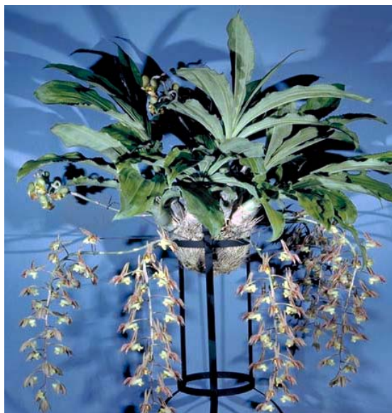
FIGURE 3 -- Catasetum fimbriatum , R.F. Orchids', CCM/AOS (92pts)

The male flowers of these Catasetum species are highly variable in color. The