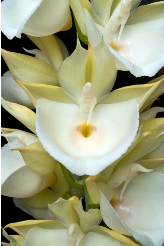
FIGURE 6 – Catasetum pileatum 'KG's El Supremo' AM/AOS (81pts)

surprised (if not doubtful) to learn that the plants are capable of producing an entirely different flower of another sex! Early collectors and classifiers of Catasetum species with unisexual flowers were likewise not aware of the two-sided nature of these species. As a result, the same species was frequently classified as two separate species: one based on the male flowers, the other on the female flowers. Imagine the surprise — and confusion — when a plant collected bearing female flowers produced quite a distinct set of male flowers in cultivation!