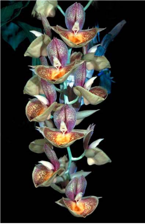
FIGURE 9 – Catasetum Orchidglade 'Orchidglade II', AM/AOS (83pts)