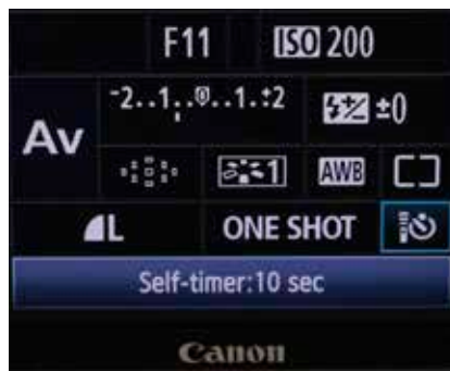
Orchid Still Settings