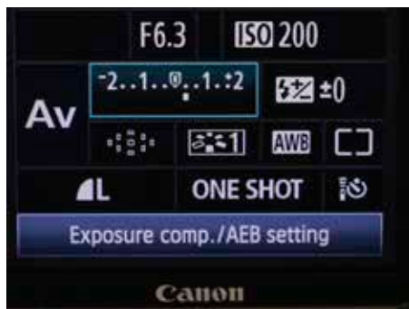
Grower Label Settings

1. Orchid Stills: As I mentioned earlier I shoot an image of the growers information label before shooting each orchid. First I set the ISO on 200 then set the F on 6.3, slide the exposure compensation to +1/3, and make sure that plenty of light is illuminating the label, make sure it's in focus, then shoot. Next I prepare to shoot the orchid, I set the F on 11, slide the exposure compensation to -2/3, select my focus point and shoot. I will often over or under compensate the exposure to make sure I have a good shot. Next I will zoom in or zoom out or move my camera for a different composition.