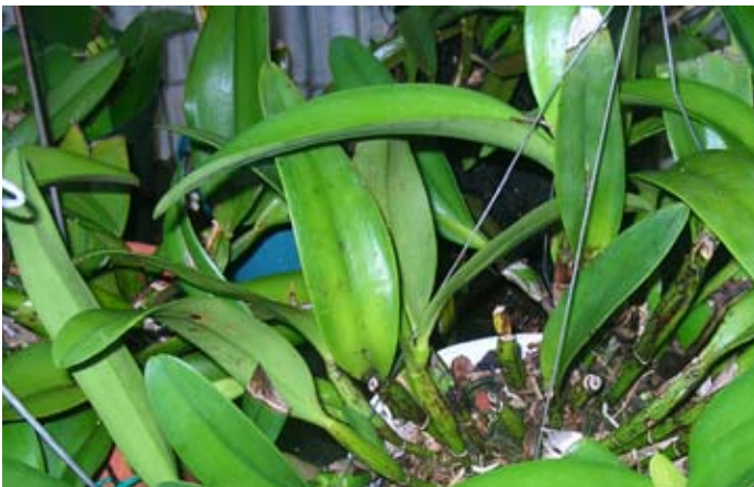
Too little light

A. Maybe. If you have 5 new growths, you are doing just about everything right! If the paper sheathing is gold but is tightly attached to the pseudobulb, not holding water and the lead is firm, there is no problem requiring action on your part. If there is any evidence of a place where water can accumulate, you have the potential for the new lead to rot. To prevent this, remove any paper sheathing that could hold water by peeling it back and away from the lead. If there is any softness in the lead with black or gray discoloration, you should be concerned that the rapidly progressing pythium or black rot is attacking the plant requiring immediate action on your part. Pythium is most prevalent during the hot summer months. It starts as a discoloration that can go from the roots up or the leaves down. If pythium is suspected, you must sanitize the plants by cutting away the infected tissue and then apply Subdue, if you can locate a source of this expensive fungicide.