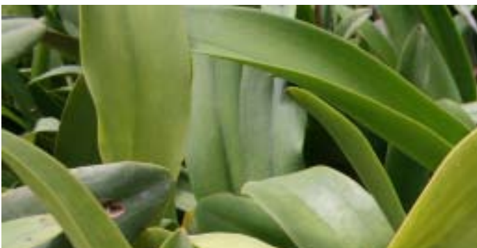
Light is just right