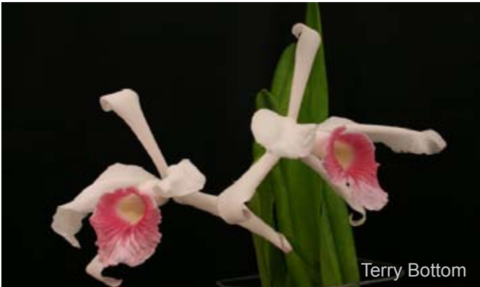
Terry Bottom Grower Sue Bottom L purpurata var carnea ('Labio Grande' x 'Fresa')