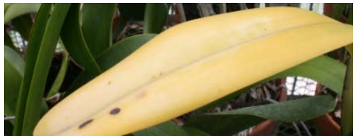
Too much light