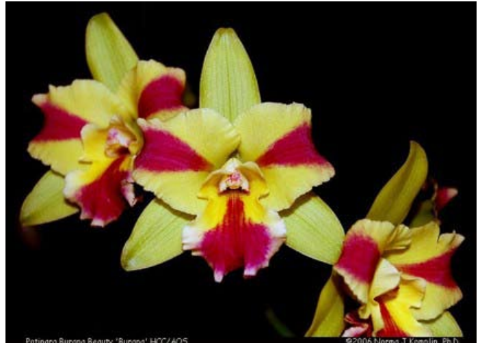
Potinara Buranas Beauty 'Burana' HCC/AOS

A. Yes. If your cattleya leaf is a beautiful lush green, it needs more light. The leaf of a cattleya should have a slight yellowish cast and after the leaf hardens (about 3 months) should be as hard as cardboard. A leaf showing lots of red pigmentation is indicative of one getting great light but if the entire leaf darkens to a dark purple, or the leaves are really yellow, the plant might be getting too much light and would have to be moved or shaded. You should see changes in leaf colors within 2 to 4 weeks of adjusting the light the plant receives. Avoid moving a plant into substantially more sun too quickly, or having water on the leaf during the bright midday sun, both of which can cause sunburn, which will appear as a scorched area fading to a dry, brown sunburn scar that will be present as long as the plant has that leaf. The SAOS has a light meter for use by members. Email Haley or Betsy to reserve it for the next meeting (or make other arrangements to pick it up) so you can determine how intense the light is in your growing area during the course of the day.