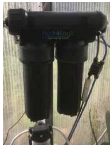
100 gallon per day RO unit

to the plants. Because the RO water has no buffering capacity, the pH of the water/fertilizer mix drops into the 3's, about the same as orange juice. I use a potassium silicate product that raises the pH back up to 5.5 or so. This also provides necessary silica to the plants that was removed from the source water by the RO system.