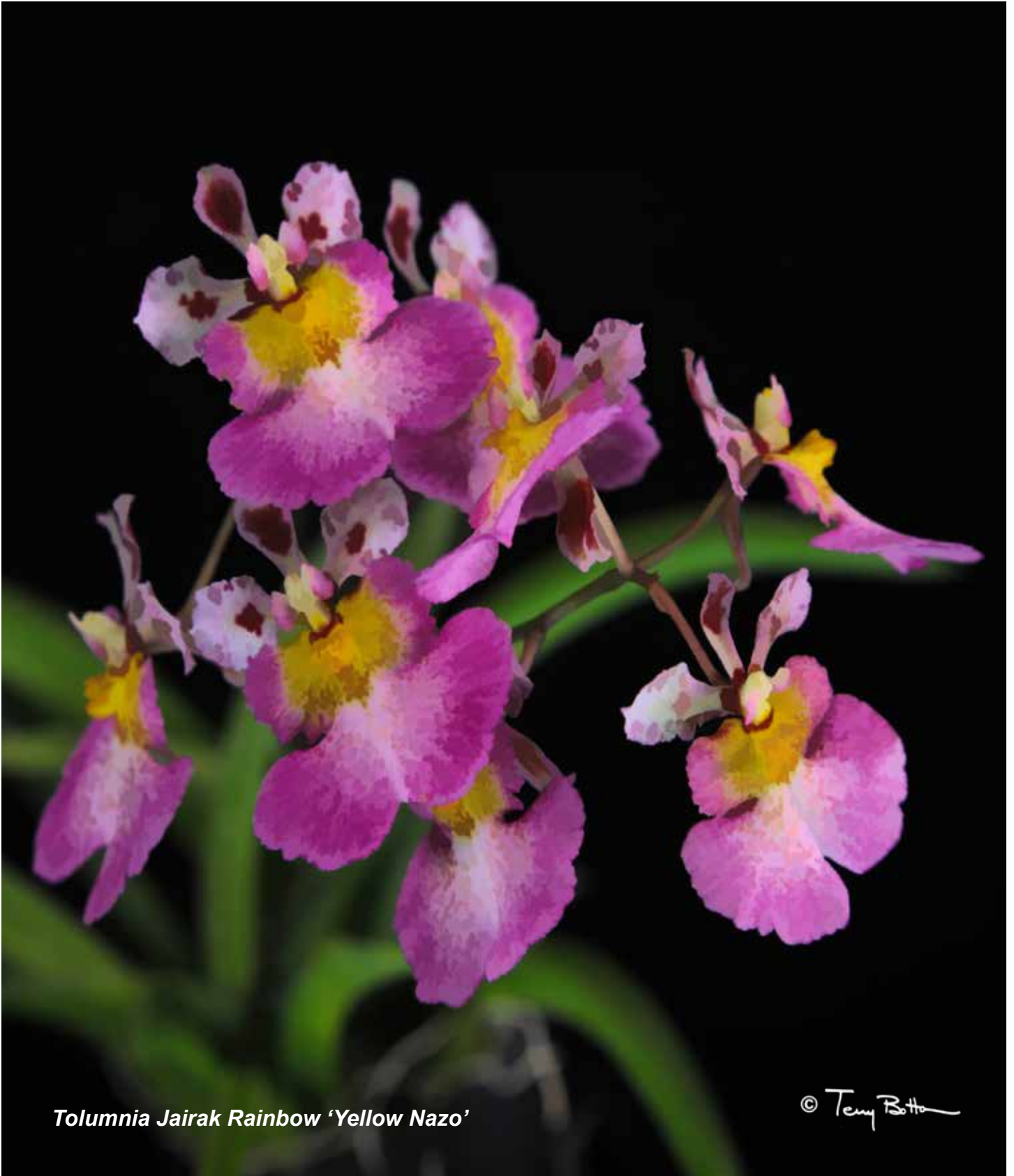
Tolumnia Jairak Rainbow 'Yellow Nazo'