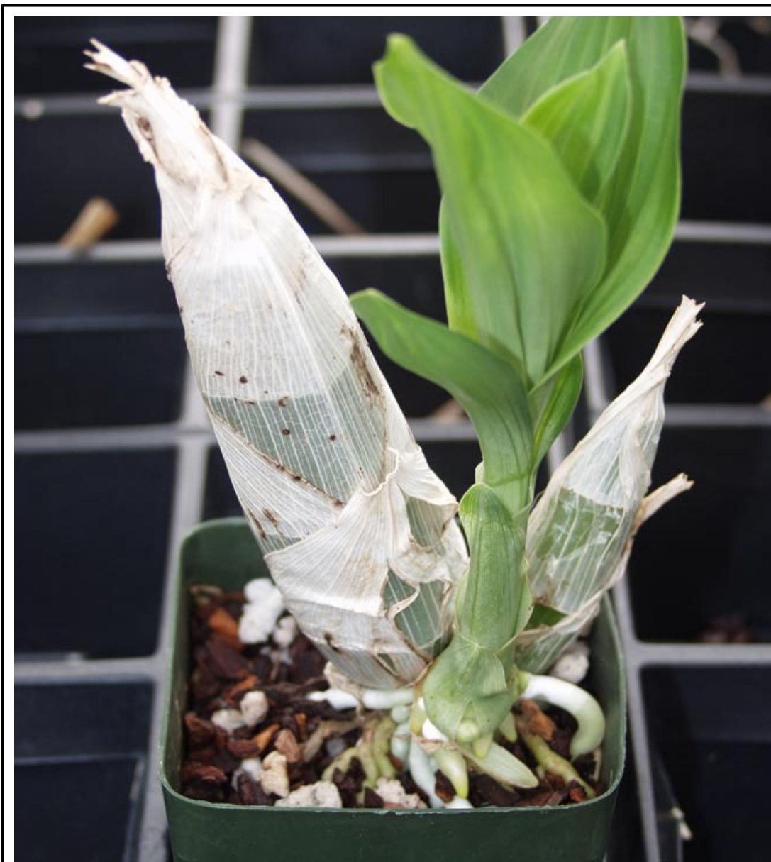
No water, roots too short