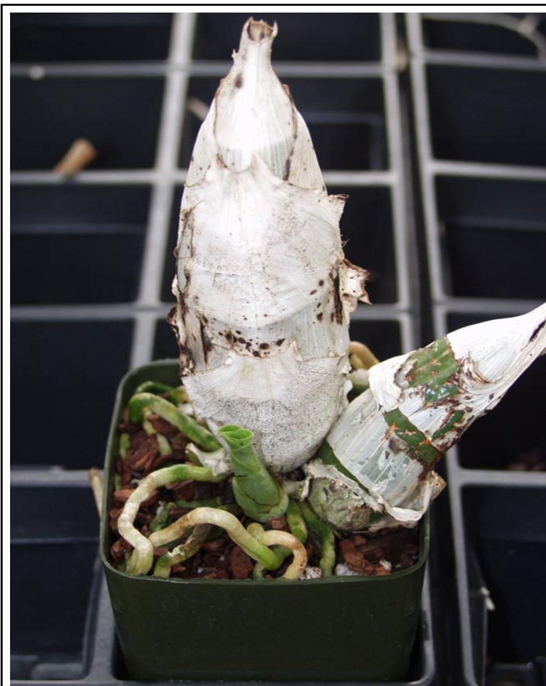
No water, growth just started