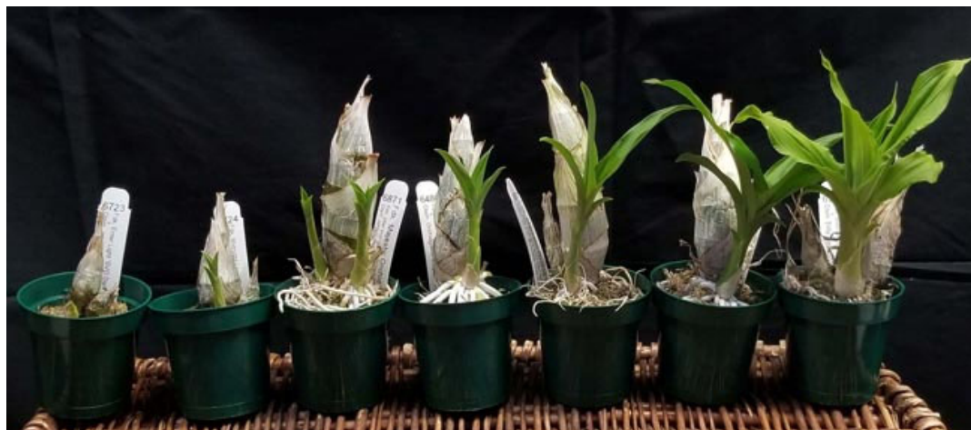
This is the size to begin watering ^