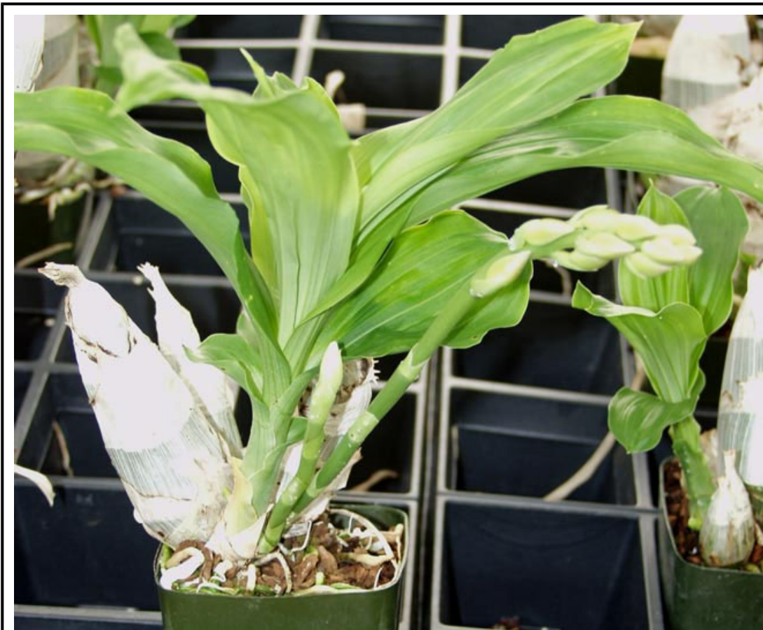
Fully rooted plant, top growth 10" water and fertilize regularly