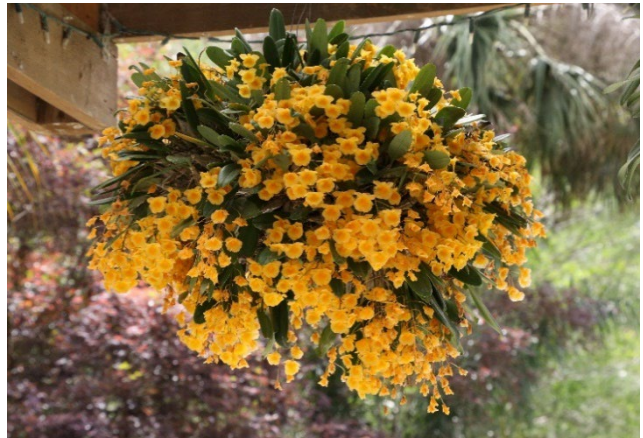
The spring blooming dendrobiums put on quite a show after their coolish, dryish winter rest.

Sometimes it takes some ingenuity to keep our orchids happy while they are in their winter homes. In the spring we'll be able to return them to the great outdoors to the bright shade and buoyant air conditions where they really thrive.