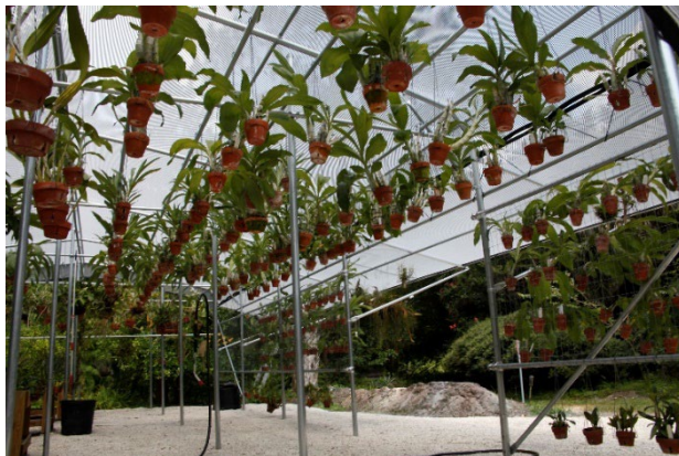
Plants thrive growing outdoors under shade cloth receiving filtered light, rainwater and buoyant air movement.

Away from the equator, most plants time their growth and flowering at least in part by this seasonal clock, with summer blooming species termed long-day plants, and spring- or fall-blooming species called short-day plants. Temperature patterns and rainfall interact with day length, but if you keep a long-day plant growing under short-day light conditions, it is unlikely to flower, regardless of variations in temperature and moisture. The same can be said for short-day plants growing under consistently long days; a poinsettia kept in the living room will not rebloom because the lights you leave on at night fool it into thinking it is still summer.