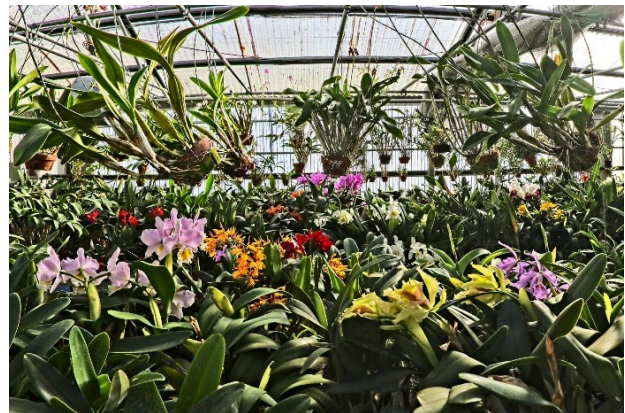
The greenhouse in January, with a thermostat controlled heater keeping plants toasty on cool nights.

If you grow in a greenhouse or other outdoor structure, the plants respond naturally to the seasonal changes in day length. Commercial nurseries sometimes fool their plants into blooming out of season by covering them in the late afternoon to simulate short days or lighting them at night to simulate long days. If you bring your plants indoors or into an artificially lighted area, be careful to not reset your plant's bloom clock by leaving lamps on in the plant room.